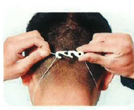
Ear loop extender